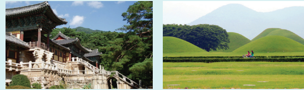
< Gyeongju City: Ancient Capital city of Shilla Dynasty >