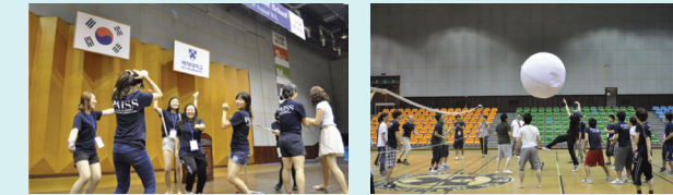
< Athletics Competition >

- Applicant must send written notice by e-mail to withdraw.