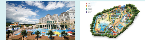
< Tedin Water Park >