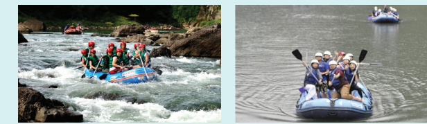
< Rafting >